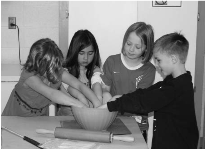
On rehearsal day, the communicants worked together to bake the bread for their First Eucharist celebration, and each child took a mini-loaf home.

Twenty-three children celebrated their first communion this Easter season at Good Shepherd. They prepared for the day by attending Mass and formation classes with their parents for at least two years. They learned the stories, explored the symbols, and experienced the rites and prayers of the Mass.