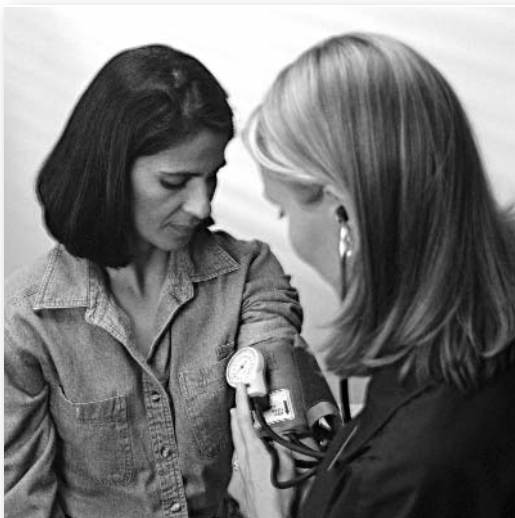
Blood Pressure checks are offered once a month in the Chapel after all Masses and before the Saturday 4:30pm Mass.

If you knew that taking some time after Mass to have your blood pressure checked could have an influence on your health, would you do it?